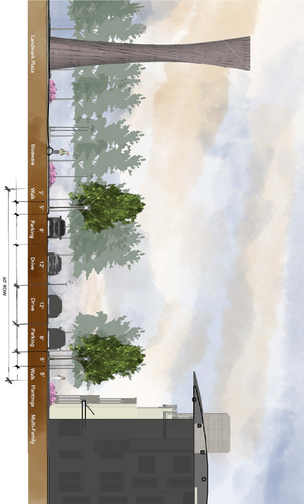
Exhibit 'C' Typical Street Standard