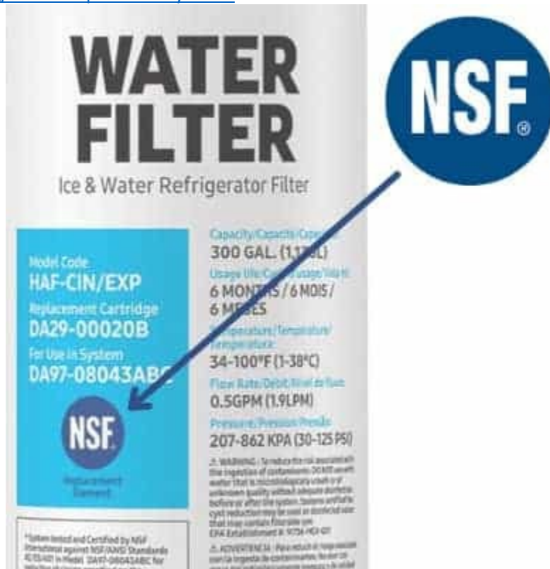
NSF Certification Symbol

NSF - https://www.nsf.org/certified-products-systems