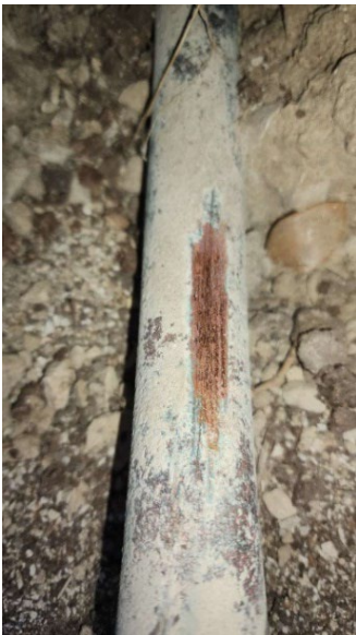
Example of Copper Pipe: