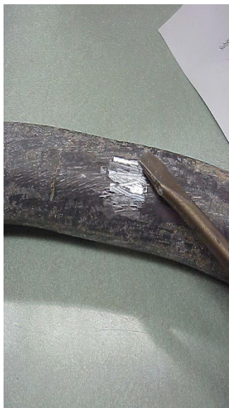
Example of Lead Pipe: